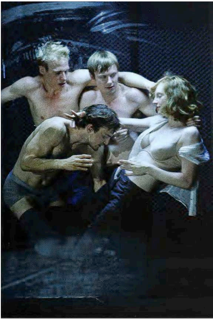
• Protect me